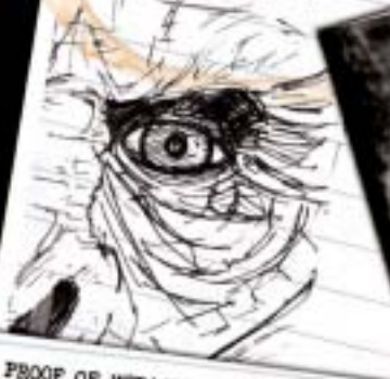
Frame 44 from the Major Patterson-Bell Gorilla, taken at Red Creek, California

Paranormalist File 1034/ Sasquatch on Bodmin Moor. Following reports and sightings Screening reports and sight Investigation have opened this This file contains observations quatch in Cornwall, 1980.